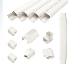
3" 15Ft AC Line Cover Kit