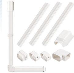
4" 11Ft AC Line Cover Kit