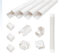
4" 15Ft AC Line Cover Kit