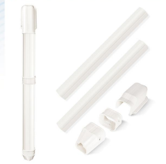
3" 7.5Ft AC Line Cover Kit